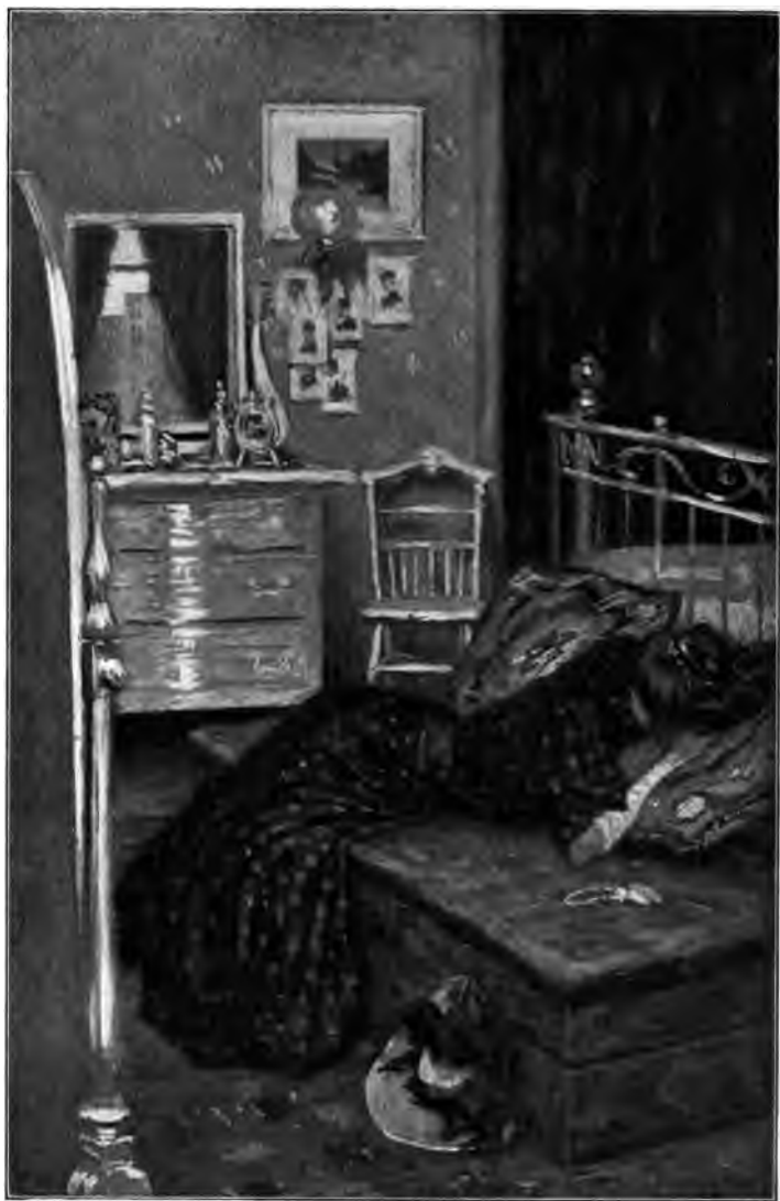
SHE YIELDED TO THE BITTERNESS